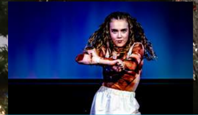
Bodmin College Dance Platform