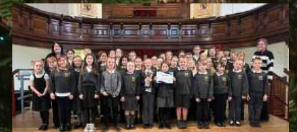
St Austell Festival of Music and Speech