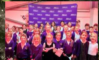
Carclaze sing on BBC Radio Cornwall